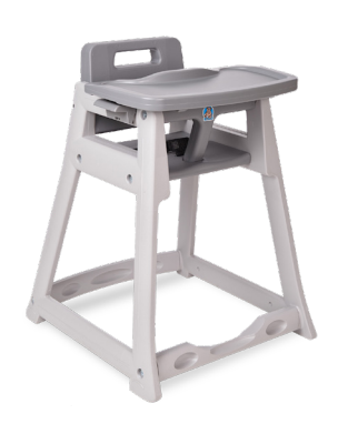
Diner High Chair KB950-01