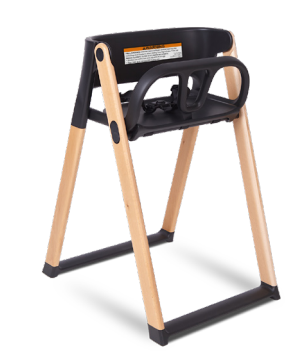
KoalaKare Stowe™ KB615-02