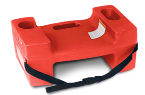
Booster Buddy KB116-03

Keep your Koala Kare products in good working order for the families who visit your establishment. By performing regular maintenance and purchasing replacement parts when needed, your products will safely meet your establishment's needs for many years to come. Use the checklists below to examine your booster seats and make sure they are safe and sanitary.