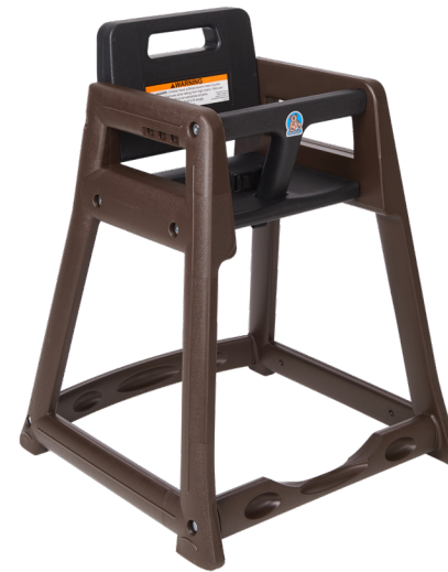
Diner High Chair KB950

Easy to clean, durable chairs with a 5-year warranty