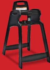
Eco High Chair KB833*

A new federal standard (ASTM F404-18) to improve the safety of all high chairs – both in restaurants and at home – was approved by the Consumer Product Safety Commission (CPSC) and took effect on June 19, 2019.