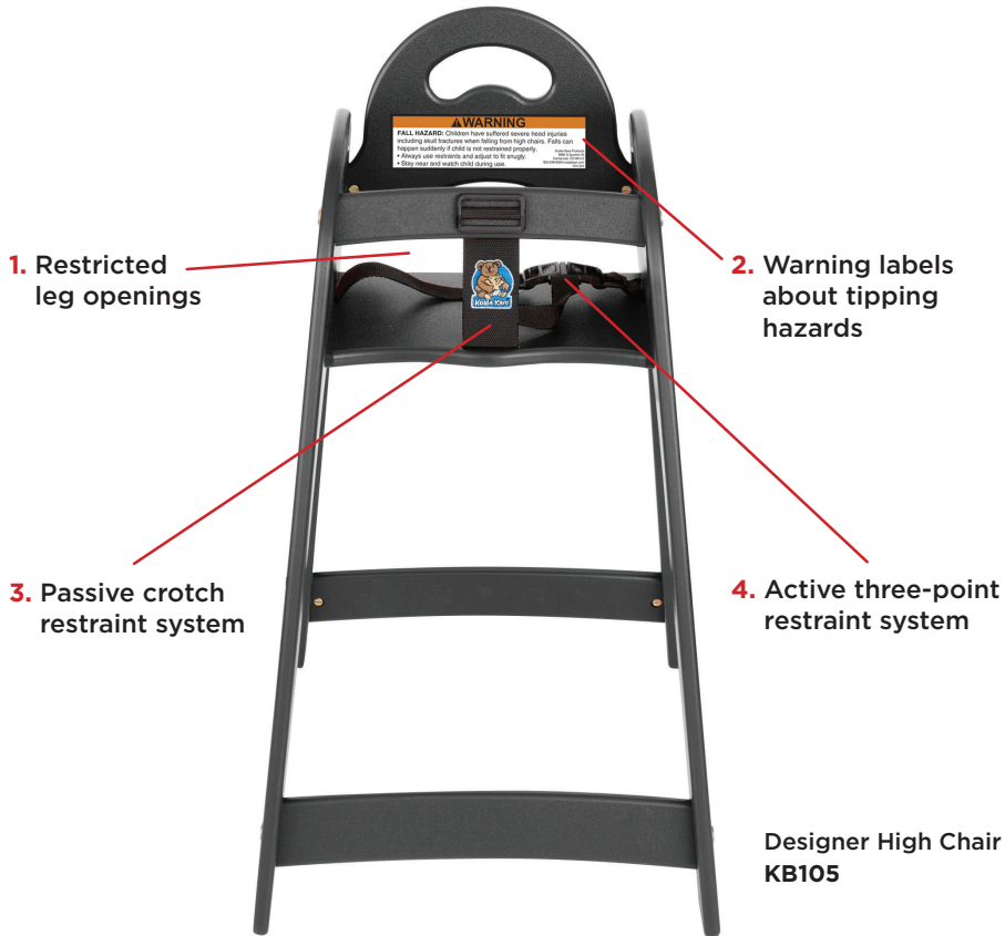
Designer High Chair KB105

The following are part of the new safety requirements for all high chairs: