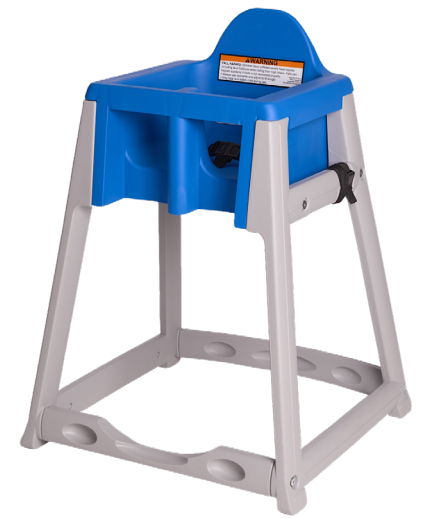
KidSitter High Chair KB977