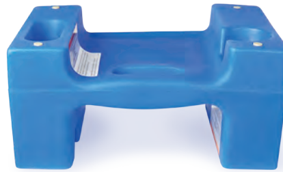
KB116-04S Blue UPC: 716954011619