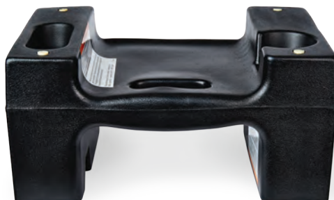
KB116-02S Black UPC: 716954011275