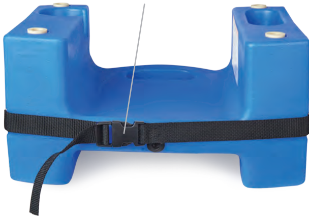
Ability to be attached to an adult chair

Koala's booster seats are age-graded for 36 months up to 5 years of age