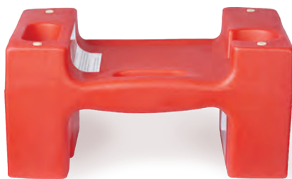
KB116-03S Red UPC: 716954011602