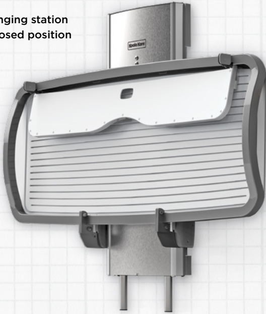
Changing station in closed position

Integrated height controls on wall unit and stretcher resist tampering