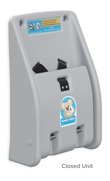
Visit www.koalabear.com/KB102 to learn more.