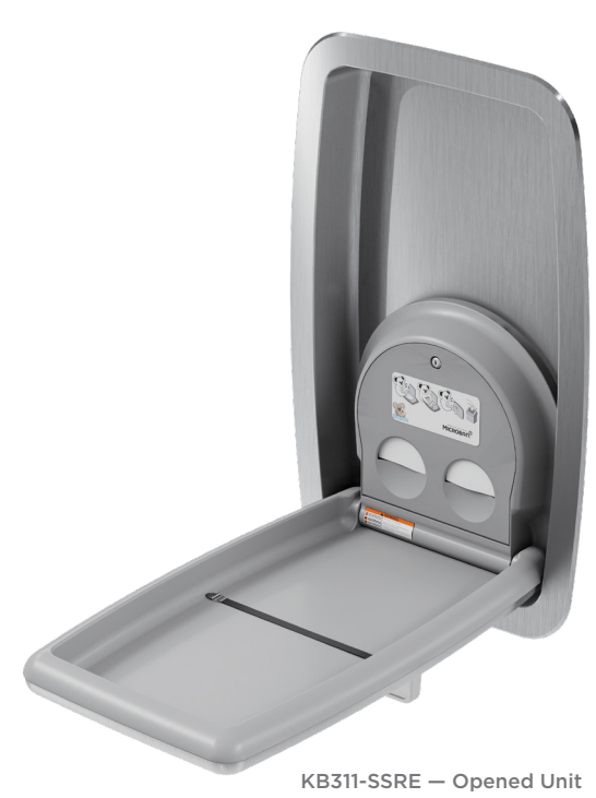
Vertical KB311-SSRE and KB311-SSWM units feature a spacesaving orientation for small or narrow restrooms.