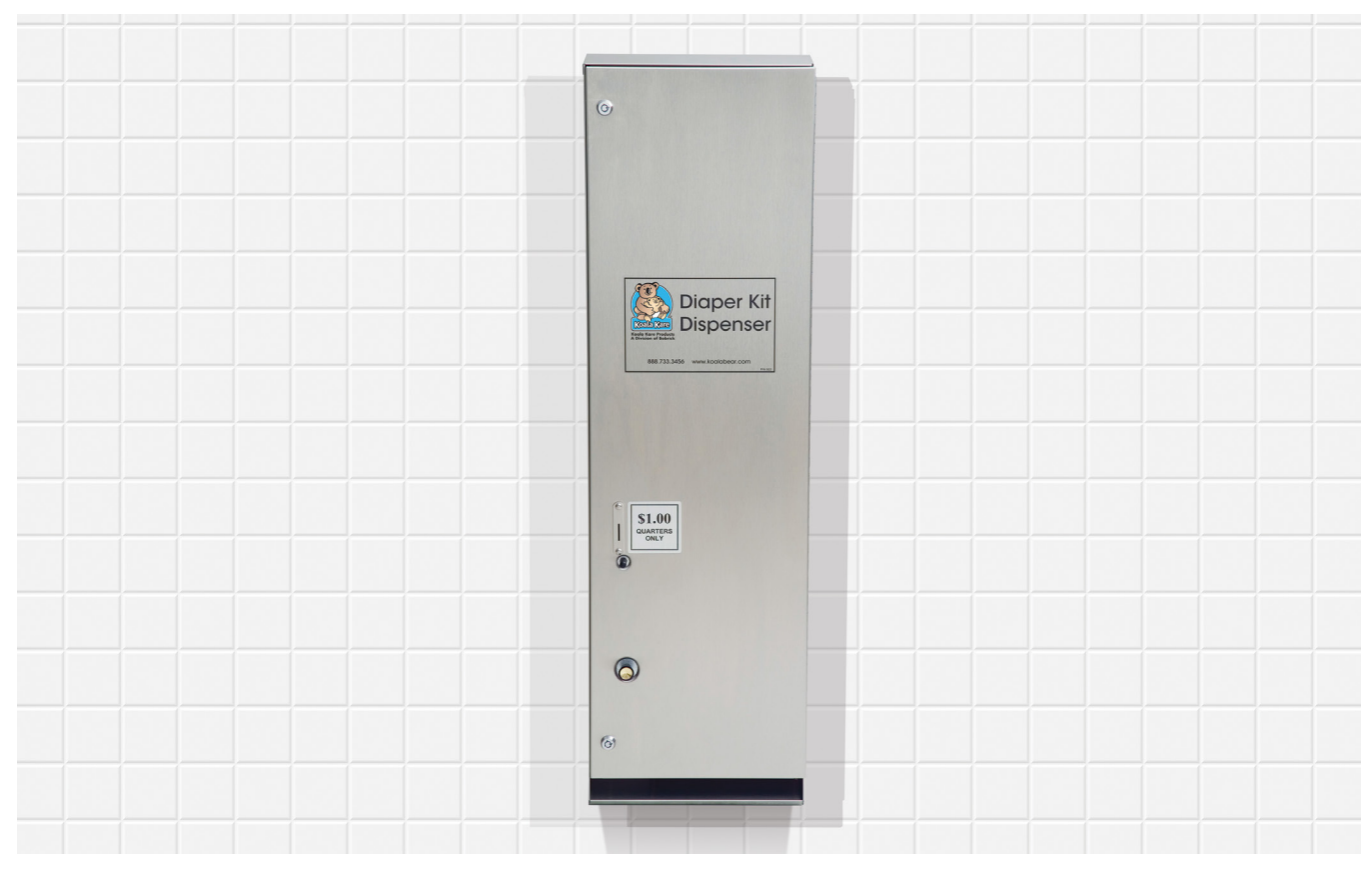
KB143-SS Stainless Diaper Dispenser

The Koala Kare Stainless Steel Diaper Dispenser comes in surface- or recessedmounted versions. These units dispense onetime-use diaper kits containing a disposable diaper, bag, a Koala sanitary bed liner and two sanitary wipes.