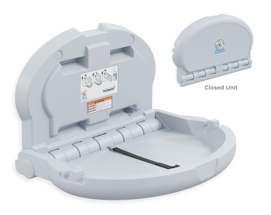
Visit www.koalabear.com/KB208 to learn more.